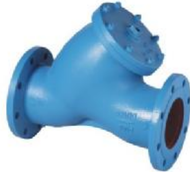
Fig No. :STR801-PN16

NOTE: 1.DN50~DN300 meshes \Phi 1.5 DN350~DN600 meshes \Phi 3.0 2.It can be manufactured according to customer's requirement 3.DN450~DN600 Body and bonnet's materials are EN-GJS-450-10